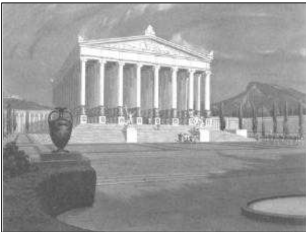
This is the Artemis Temple at time of Paul.