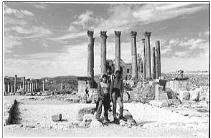
This is the Temple-site as it looks today.