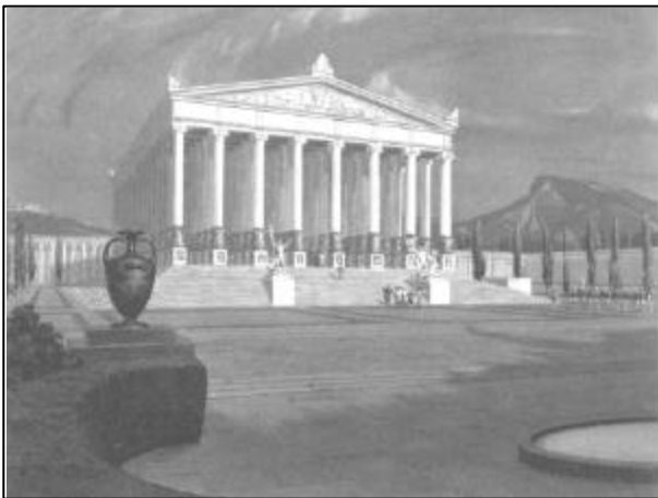
This is the Artemis Temple at time of Paul.